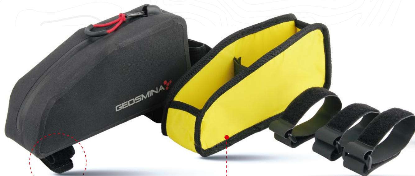
HYPALON REINFORCED VELCRO® STRAPS